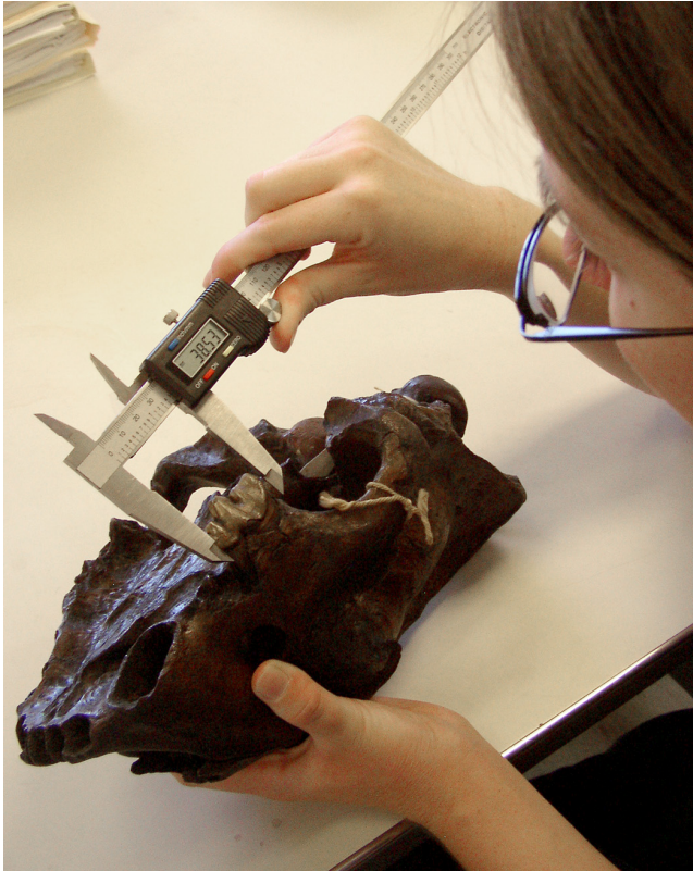
Fig. 2 - A student measures a specimen of the saber-toothed cat, Smilodon fatalis , to estimate its body mass.

For students, the most important aspect of this course project was the opportunity to conduct original research consisting of data collection, analysis, and the presentation of findings in written and oral reports (fig. 2). Specifically, students learned (1) the state of knowledge on the subject by reading and discussing the most recent journal articles, (2) how to take proper measurements of specimens, (3) how to analyze quantitative data with statistical software, and (4) how to make inferences about the functions of limb bones based on analysis of their shapes. The research culminated in two papers (one on the saber-toothed cat and the other on the dire wolf) that are potentially publishable in professional journals. In other words, the students not only learned how to conduct specimen-based research, but also actively generated new knowledge, contributing to the research mission of the UCMP. We suspect that similar, research-oriented course projects using museum specimens