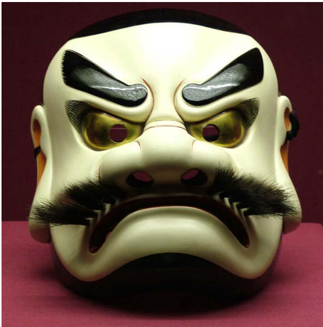
Fig. 5 - Japanese Shinto Noh mask. UCA0310

Security is an issue for a small number of departments, who have items of cultural or historic importance in common / accessible areas. Security concerns split objects into two categories: items