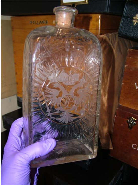
Fig. 7 - One of a set of vodka bottles owned by Catherine the Great. UCA1086

A temporary exhibition, Highlights from the Cultural Collections Audit , opened on 24 February 2006 running for six weeks in the Main Library. The exhibition was held to introduce the Audit and communicate its aims, objectives and successes to a wider university and semi-public audience. Ten objects and collections were featured, including items from the School of Literatures, Languages, and Cultures, the Institute of Atmospheric and Environmental Sciences, the Moray House School of Education, and the University Old College Vault. Placed in an area of the library dedicated to IT training, seminars, and meetings, visitors to the temporary exhibition included staff, students, and outside visitors to the library.