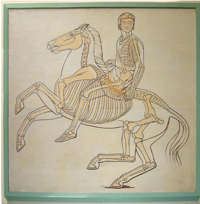
Fig. 6 - Mural of a skeletal man and horse. Royal Dick School of Veterinary Studies. UCA0729

A Cultural Audit webpage was considered an excellent opportunity to make the findings of the Audit accessible to the public, at every stage of the project. 1 A central Audit page was created to welcome