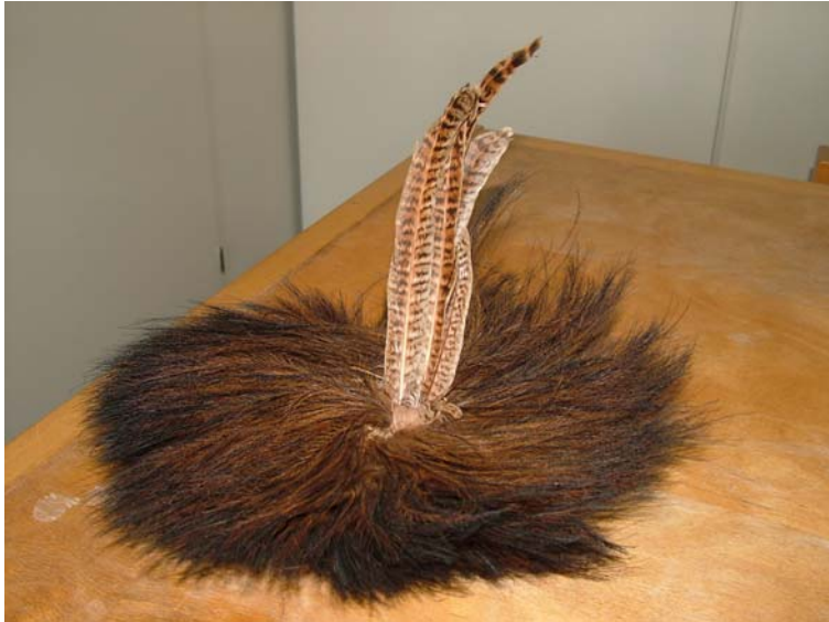
Fig. 3 - Headdress from the Social Anthropology Teaching Collection. UCAC0084

The response of colleagues in all areas of the university has been overwhelmingly positive. Colleagues have gone out of their way to assist in the Audit, understanding that their knowledge contributes to the creation of a multifaceted and continually expanding record of innovation and