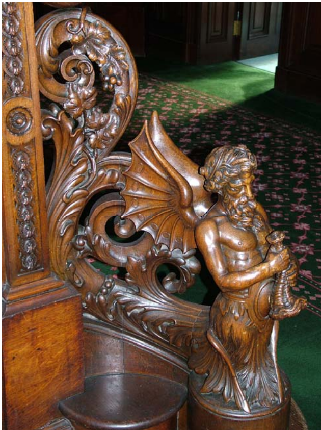
Fig. 2 - An elaborate carved figure at the base of the main staircase in St Leonard's Hall. UCA1009

non-formal distributed heritage collections across the university.