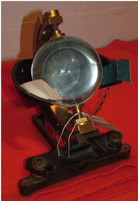
Fig. 8 - Sunshine recorder. UCA0871

There are a number of challenges and considerations that face the year-to-year maintenance of the Cultural Audit project. Some of these issues are included below, as are recommendations for future improvement.