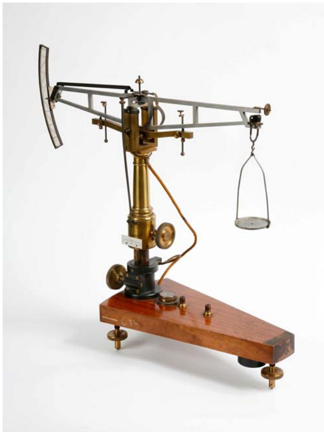
Fig. 1 - Scales "de Cotton"

The aim of this paper is to analyse the various role that were conferred to university collections and museums within the University Louis Pasteur of Strasbourg for the last thirty years. This reflection is at the crossroad of four major phenomena that occurred quite at the same period: the broadening of heritage concern, the building of scientific and technical culture of science, the entering into the era of communication, the rising concern of universities to be recognised as a cultural actor. All these phenomena participated at different level and in a different way to give a new role to university collections and museums and still do. Meanwhile, they are also various expressions of the dramatic changes to which French universities are confronted to since the late 1980s: for instance, disengagement of the State, rising of international competition, the praise of techno-scientific value of knowledge versus fundamental research, the rising concern of public opinion towards scientific research and their applications, the change of social position of academics within the political area. Thus university collections and museums participated to the numerous questionings university was confronted to toward its future. However, going with those changes, doesn't assure that university collections and museum are to be given a role once the change has occurred. Even if they are, what that role should be?