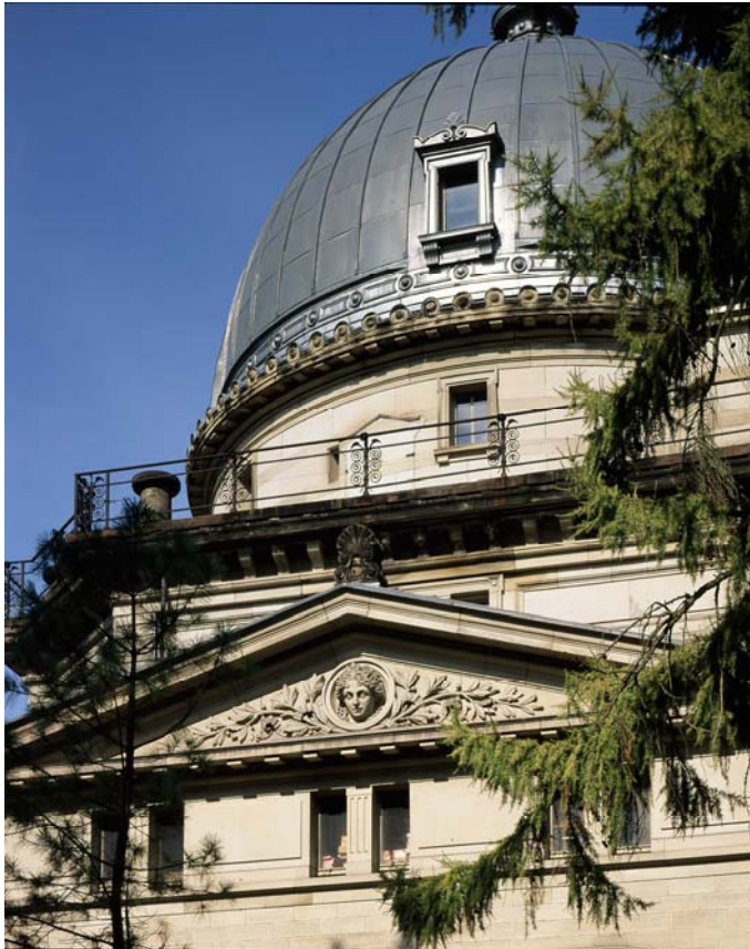
Fig. 3 - Big cupola of Strasbourg observatory

At the beginning of the 1980s, scientists of the University Louis Pasteur of Strasbourg, often physicists, usually retired or about to be, undertook to preserve various scientific instruments of the University. In 1982, they created an association called AMUSS, Association for Science Museums in Strasbourg. Their goal was “to valorise and animate existing scientific museums and collections and to create a Museum of science and technology in Strasbourg” 1 . The University Louis Pasteur already