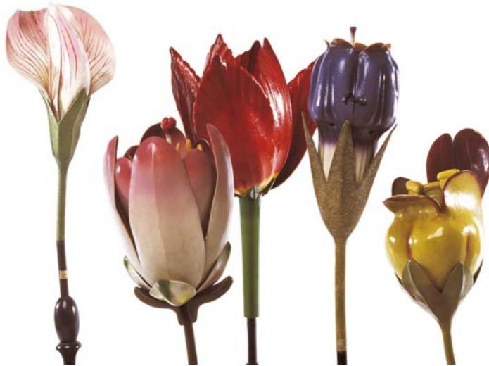
Fig. 2 - Models of flowers

It is this increased concern within the scientific community for heritage preservation that I would like to discuss in this presentation. How was this heritage process put in place? By whom? What was at stake? Was it successful? What was the impact on university collections and museums? To study these points I will focus on the University Louis Pasteur of Strasbourg.