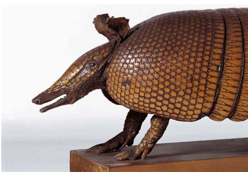
Fig. 8 - Armadillo

This ceaseless fluctuation of the use of heritage, and the goal that sustain heritage preservation, certainly make scientific heritage different from the other kinds of heritage. The other types of heritage