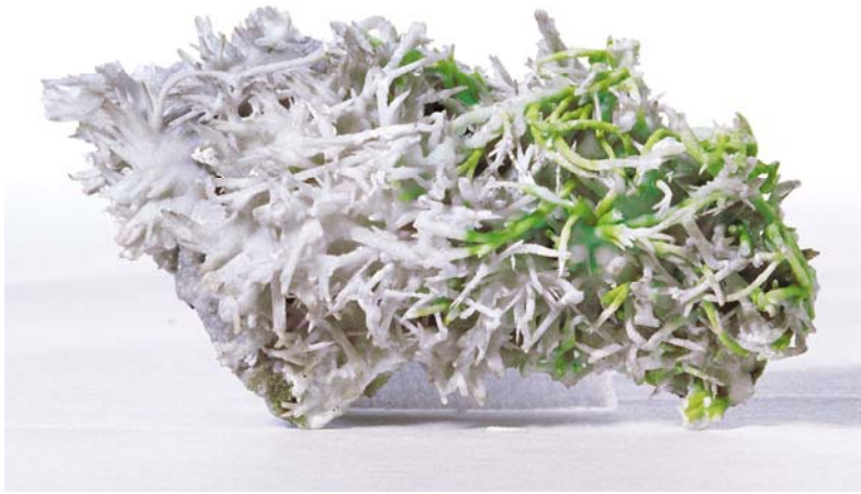
Fig. 6 - Coral aragonite

creation of a department of history of science attached to the new centre. The only remaining heritage item left is the submarine which is still in the park. The astronomical telescope of Paris observatory, “la grande lunette coudée”, which was also supposed to be in the park, was not as lucky and stayed for many years under the ring road next but outside the storage.