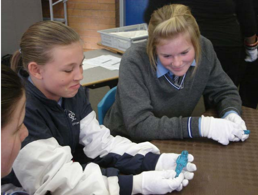
Fig. 6 - Students from Leeton High School wearing gloves and working with ancient Egyptian artifacts over padded tables

The traveling road show is one part of the strategic alignment of the museum to the university. It links with the concept of 'engagement', one of the core values of Macquarie University (MACQUARIE UNIVERSITY 2008: 6). It also echoes the themes of the university, namely "Macquarie's commitment to