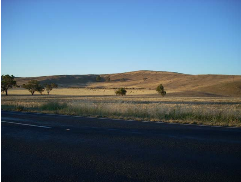
Fig. 3 - On the road to Leeton, NSW, looking at drought-affected countryside