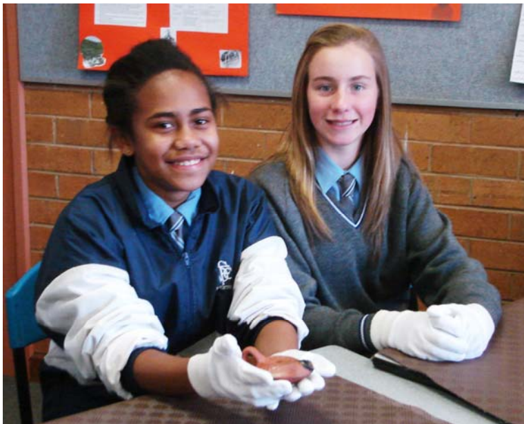
Fig. 1 - Two Year 11 students from Leeton High School in southwestern NSW handling ancient objects from the Museum of Ancient Cultures collection

University museums by their very nature are concerned with education. As educational theory has developed throughout the twentieth century, the approaches taken in developing museum-based education programs have also changed. Today those concerned with such programs in museums (HEIN 1991; HOOPER-GREENHILL 1999) espouse the constructivist model whereby the learner