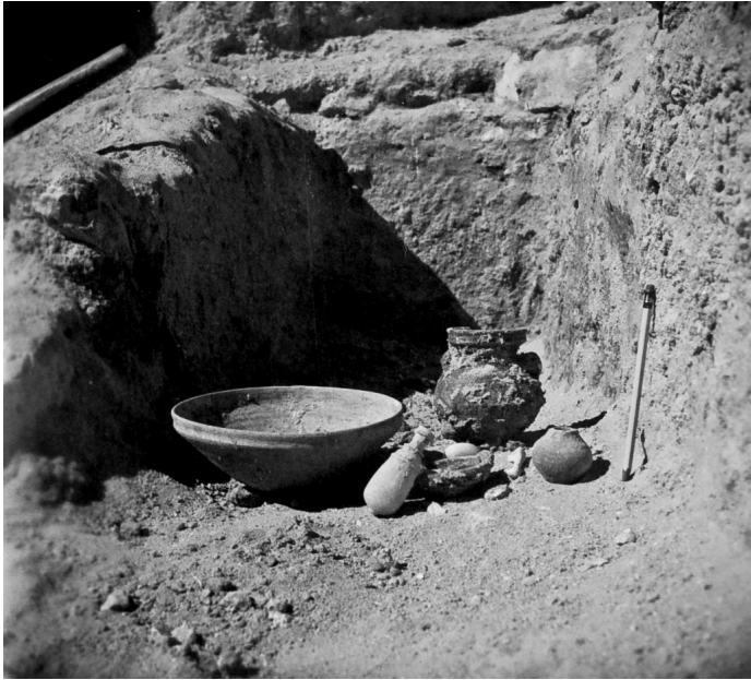
Fig. 2 - Artifacts excavated by Cornwall in Bahrain, which are currently housed at the Hearst Museum

the artifacts. So far, the team has determined that several different time periods are represented, the oldest being Paleolithic or Neolithic, with the youngest material dating to the tenth century CE. The objects excavated from tumuli provide relative dates from the late third millennium BCE to the end of the first millennium CE.