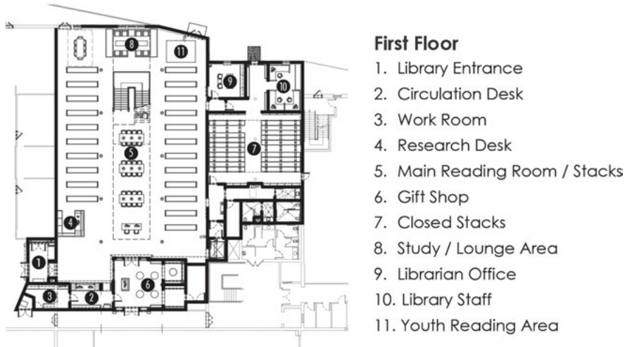
Fig. 6: First floor plan. © Pieper O'Brien Herr Architects.