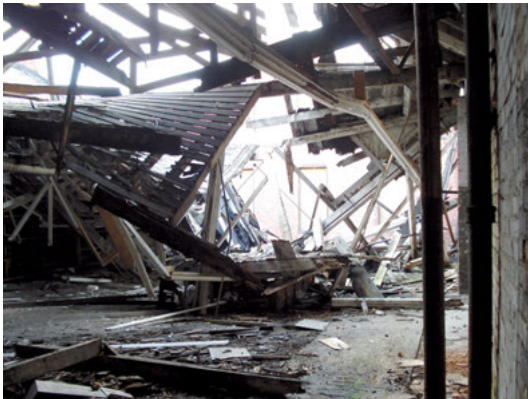
Fig. 3: The American Philatelic Research Library space before renovations. © Pieper O'Brien Herr Architects.

Following the renovation phases already described, the only remaining unrenovated space was that designated from the outset as the permanent home of the APRL: the two buildings labelled Building Three and Building Four on schematics. In the intervening years, however, a dwindling APS membership and a national recession combined to place economic pressure on the APS and APRL and delay the library renovation.