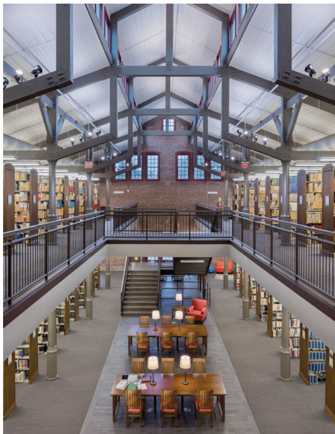
Fig. 1: The new American Philatelic Research Library reading room. © Pieper O'Brien Herr Architects.