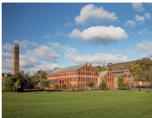
Fig. 4: The exterior of the Match Factory as seen from Talleyrand Park. © Pieper O'Brien Herr Architects.

The Match Factory façade, rising up behind the railroad tracks at the edge of the picturesque Talleyrand Park, is one of the iconic images of Bellefonte. It serves as a backdrop for community celebrations and wedding photographs in the park. The two buildings that comprise the new APRL, Building Three and Building Four, together with Building Five, a four-story building used for tenant space, and a tall brick smokestack, form the skyline. The name of one of the later iterations of the Match Factory, Universal Match Corporation, is painted across the three buildings (Figure 4).