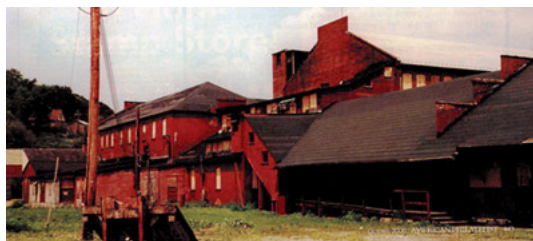
Fig. 2: The Match Factory complex at the time of the purchase in 2000.

Despite the concern expressed in meetings and in the pages of philatelic magazines, after extensive research, the APS and APRL proceeded with the purchase. APS leadership described the advantages of the new location to win member support. For example, the February 2002 issue of The American Philatelist , the monthly publication of the APS, contained an article on the history of Bellefonte, which, well into the 20 th century, boasted a larger population than the nearby college town (Wunderly 2002). In a November 2000 editorial for the society's monthly magazine, APS President Peter P. McCann attempted to allay member concerns about the APS and APRL taking on the duties of a landlord: