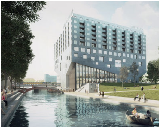
Fig. 2: The proposed new library designed by Rapp+Rapp Architects. © Rapp+Rapp.

often. The day after the plan had been voted down, a director of asr, an insurance company, tweeted that if the library was to be housed in an existing building, they had one on offer: the former main post office, right in the heart of the city (Figure 3). Within one week, contact was made; a viewing of the building was held to see if it was a realistic option; and within ten days library staff were sitting at the table of Rijnboutt architects in Amsterdam to prepare plans for a library in the post office.