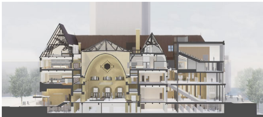
Fig. 7: Section through the building. © Rijnboutt.

A primary design question was how to create an appropriate relationship between the new building in the former yard and the surrounding historic construction. For the architects, the size and volume of the new building were such that a contrasting solution would have resulted in a fragmented scheme lacking coherence. Instead, they sought a solution where the new would have its own character but would have elements in common with the existing building. The connection between old and new was established through a respectful, but different, interpretation of the façade using vertical controlling lines, a similar ratio of solid to void, and an interplay of horizontal lines, ornamentation and relief work.