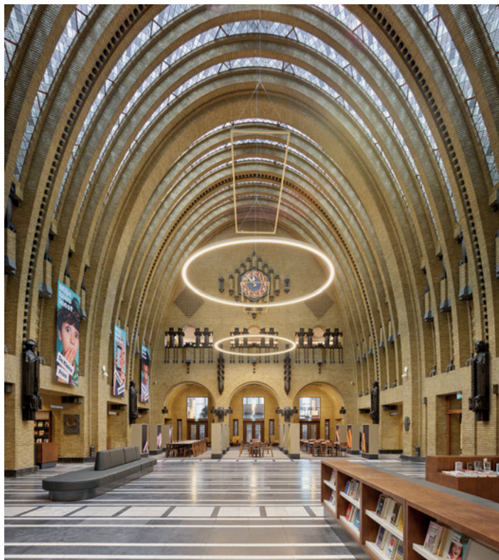
Fig. 1: The main hall of the Neude Library. The library got its cathedral.