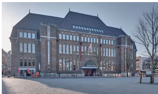
Fig. 4: The Neude Library 2020.

Finally, in March 2018, the building process commenced. There was some delay while archaeologists carried out interesting excavations in the former courtyard. An old watercourse under the building kept flooding the pits for the elevators. After almost 22 years, the library finally opened in 2020 (Figure 4).