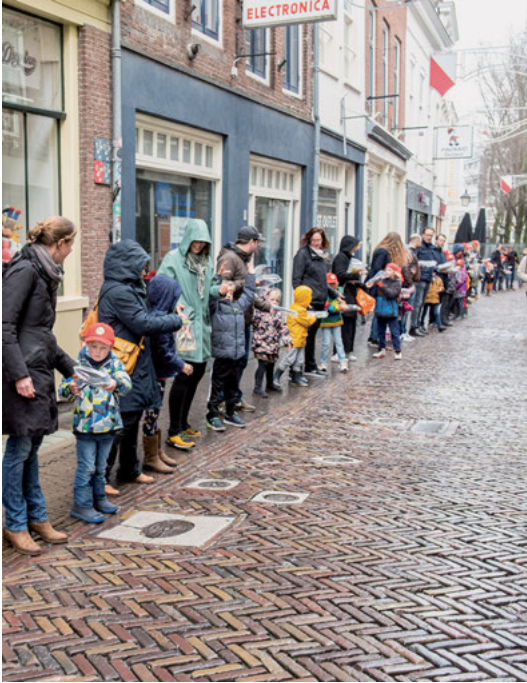
Fig. 10: Great book movement by kids.