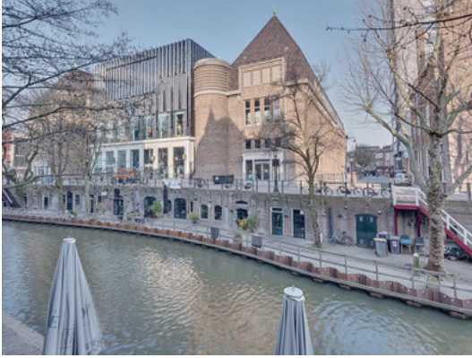
Fig. 5: The new rear elevation of the Neude Library.

space amidst the shopping area. To give the historic building a place in the active life of the city, the library had to open on to the Neude square and it needed a second façade and a formal address at the former distribution yard (Figure 5).