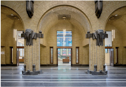
Fig. 8: Openings and escalator.

The public library is all about connecting people, just like the post office was, in a different way. In the old days, the connection between people was made by the telephone exchange and the sorting and distribution of letters. Now the post office has become a special meeting place for the citizens of Utrecht where knowledge can be created and shared in one of the most iconic buildings of the city: the Neude Library.