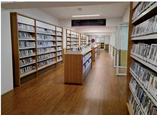
Fig. 9: Collections in the corridors.

The trend in the Netherlands is for libraries to be co-located with other partners to create a kind of village with complementary facilities resulting in the whole being greater than the sum of the individual parts. In Neude Library there is no room for other partners. The building is so deeply embedded in the heart of Utrecht and its citizens, that there are many groups and stakeholders who want to organise activities in the building as if they lived there.