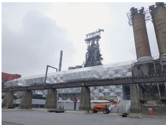
Fig. 8: University of Luxembourg Learning Centre exterior, Belval. © Ignasi Bonet.

The Luxembourg Learning Centre (LLC) (Figure 8) designed by Valentiny HVP is a spectacular example of an existing structure transformed into an innovative and inspiring learning centre for the students at the University of Luxembourg. It is part of an extremely ambitious project to regenerate the industrial site at Belval following on from a prolonged recession in the steel industry in the 1980s–90s culminating in the closure of the last of the blast furnaces in 1997. The Fonds Belval was created to construct the Cité des Sciences in 2002 and it was decided to make Belval the main campus of the newly formed University of Luxembourg in 2005.