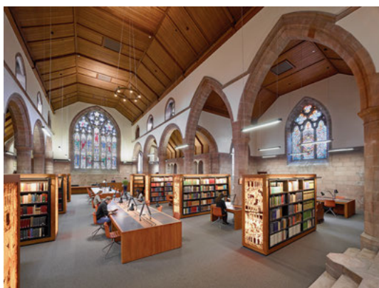
Fig. 7: Martyrs Kirk postgraduate library, St Andrews University.