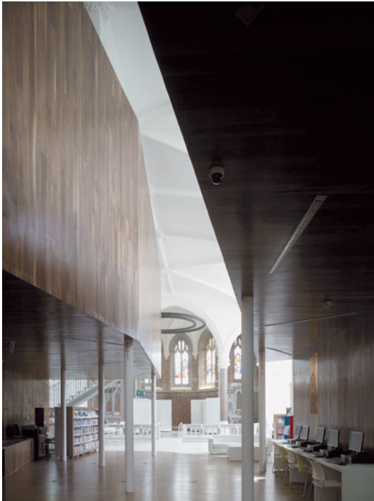
Fig. 2: Rush Library, Co Dublin: interior intervention. © Christian Richters.

old west door leading into the adult library and services desk, the children roam throughout the transepts and the chancel is now an art space with other activities such as function and lecture rooms in the side chapels and galleries (Figure 2). The churchyard has become a garden retaining the spirit of the graveyard while creating a playground and a protected public space for future generations ( http://mcculloughmulvin.com/projects/rush-library ).