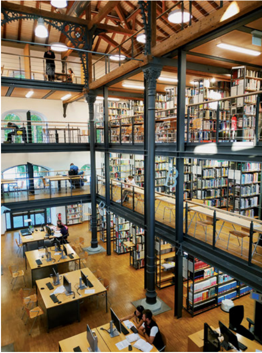
Fig. 11: Library interior, HTWG University of Applied Sciences, Konstanz.

offices for the Portuguese government including the Judiciary Police headquarters and then became a courthouse. It is a designated structure of importance. While the project has recently been abandoned, it is an interesting example of a reuse proposal ( https://www.macaubusiness.com/new-central-library-project-at-old-court-building-abandoned/ ) and pleasingly plans for a spectacular new Central Library in Macau have just been announced.