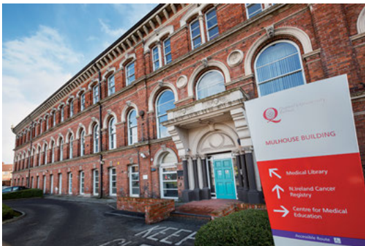
Fig. 4: Queen's University Medical Library.

The main university library at Queen's University is a purpose-built state-of-the-art 21 st century building but the Medical Library ( https://www.qub.ac.uk/directorates/InformationServices/TheLibrary/Locations/MedicalLibrary/ ) is in a late 19 th century High Victorian warehouse (Figure 4). The Mulhouse Works opened in 1881 for the weaving, bleaching, printing and warehousing of linen goods. It is an impressive structure in terms of its massing and scale built to demonstrate to the public the value of the enterprise within. The exterior is rich in detail with ornamented windows and an imposing entrance door.