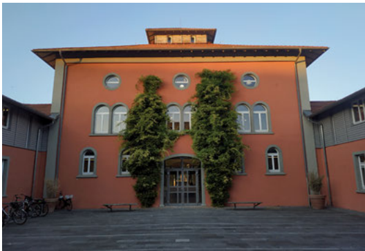
Fig. 10: Abattoir building, HTWG University of Applied Sciences, Konstanz.

opened in 1997 mainly supporting engineering and computer science students but also including material on business administration, design and architecture. The main structural elements were retained with the interior stripped out. The stunning main hall with its beautifully detailed cast-iron columns, elegant ironwork and heavy timber beams provides delightful workspaces and houses the main collection. The interior design and furnishings took their cue from the wood and steel of the original building. Study places can also be found in the side wings and journals reading room and a new area was created in 2017 to provide additional seating. Basements were created under the wings to provide space for toilets and building services.