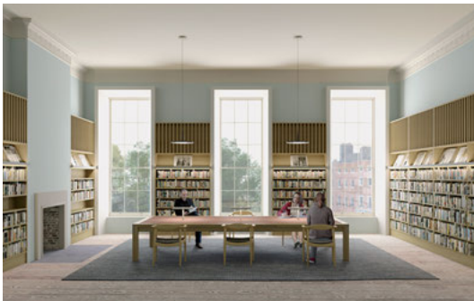
Fig. 3: Dublin City Library: proposed Georgian house interior. © Grafton Architects/Shaffrey Architects.

An exciting project which has been in the mix for some time is that for a new Dublin city library to provide an inspiring place in which all can learn, create and participate. The high-level vision is to deliver a cultural quarter for Dublin at Parnell Square anchored by a city library. The proposed development will encompass work to eight Grade I listed Georgian houses with a significant new build to the rear and the development of a new public plaza along Parnell Square North (Figure 3). Phase 1 of the project is at planning application stage in 2021 and will deliver the new build and one of the Georgian houses at 27 Parnell Square with an estimated completion date of 2023/24. Further phases will see the conservation and reuse of the remaining seven houses and the completion of the public plaza.