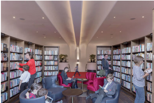
Fig. 6: Storyhouse library reading room, Chester.

Another building type which lends itself to new uses is the cinema. A successful example of a cinema transformed into a library and much more can be found in Chester, a historic city in northwest England, founded as a Roman fortress in the 1 st century CE. The Art Deco Odeon cinema, designed by Robert Bullivant with Harry Weedon who was responsible for all the Odeons at the time, opened in the town in October 1936. In deference to its historic context close to the cathedral and Victorian town hall, it was designed in red brick rather than faced with ceramic tiles as was the case in other cities. The building was Grade II listed in 1989 but after many years as a cinema it closed in 2007 and remained unused until the Storyhouse project came to fruition in 2017. The £37 million project transformed the 1930s cinema into a theatre, cinema and library building with restaurants and bars and has won many awards including one for the best reuse of an existing building. It has brought a much-loved building back into use and transformed Chester's Northgate area.