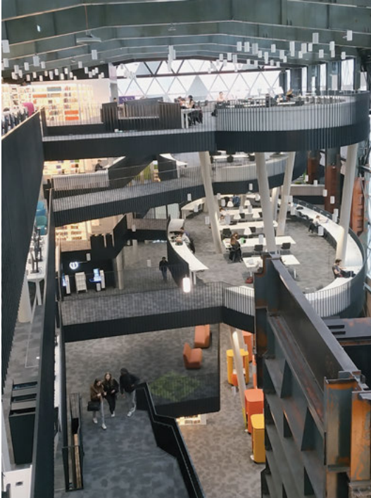
Fig. 9: University of Luxembourg Learning Centre interior, Belval.

the brilliantly illuminated shelving and the bright colour-coded furniture distinguishing the different levels of the library. Acoustic panels and sound-reducing carpets help to combat noise levels. The LLC has over 1,000 seats including individual, group and meeting room spaces. It has 10,700 m of shelving as well as a café, conference centre and three garden areas at the top.