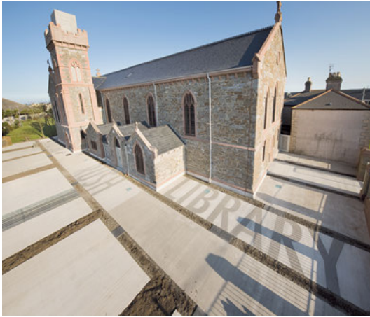
Fig. 1: Rush Library, Co Dublin: exterior.

Ireland and new uses are being sought for them. One such example is the 19 th century St Maur's Church in the small village of Rush in north County Dublin.