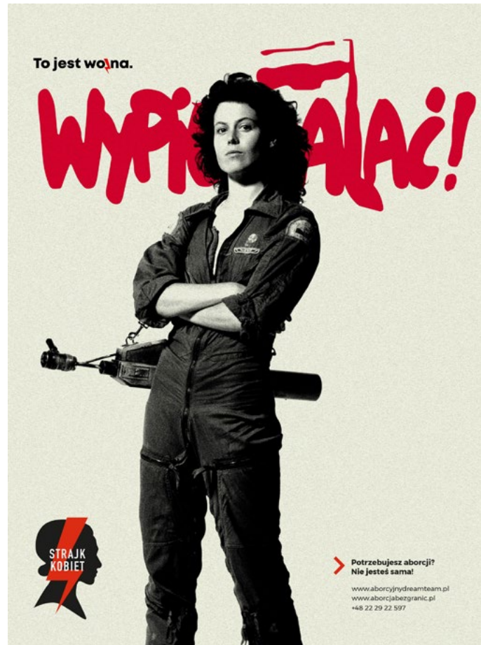
Figure 3. Jarek Kubicki for All-Polish Women's Strike: WYPIERDALAĆ!/FUCK OFF! To jest wojna/This Is War, 2020

Kill Bill neo-Western martial arts film, or Imperator Furiosa from George Miller's 2015 post-apocalyptic action movie Mad Max: Fury Road . Ripley for instance, a fictional war captain and strong heroine played by the American actress Sigourney Weaver, is one of the first and most significant female action protagonists in cinematic history and a prominent figure in popular culture. Kubicki presents her wearing military fatigues, armed with a weapon hanging over her shoulder, strong-willed and ready to fight. An additional text in the upper-left corner of the poster reads To jest wojna (This is war), accompanied in its lower part by the contact details for Abortion Without Borders and the characteristic OSK logo—a black silhouette portrait of a woman with a red lightning bolt in the middle.