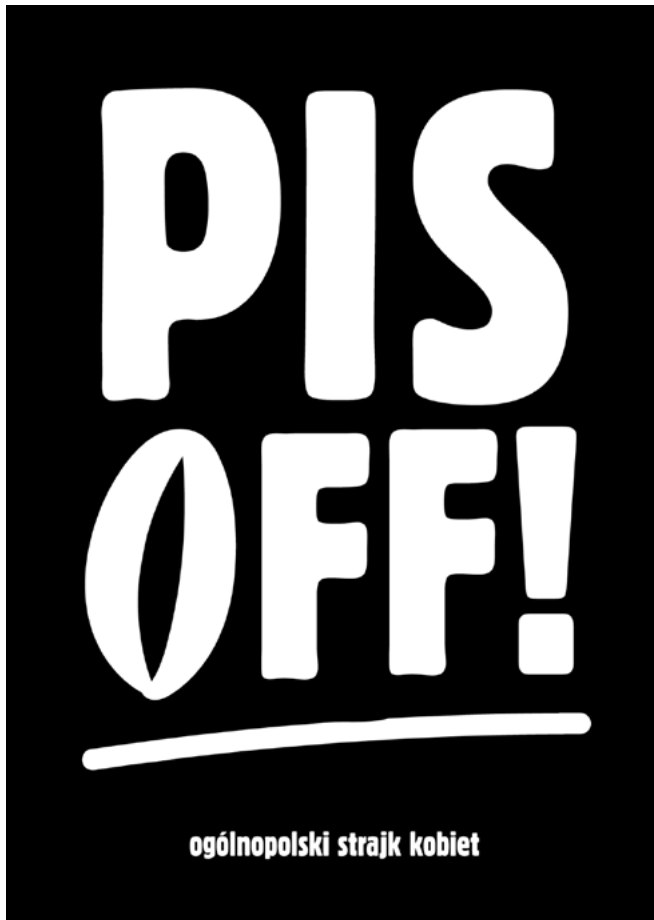
Figure 2. M for Graphic Emergency Service: PIS OFF!, 2016