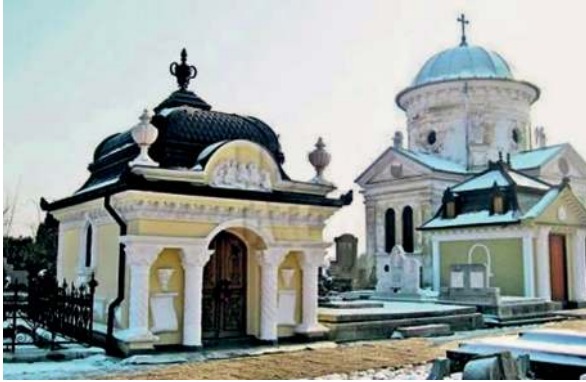
Fig. 7 Outstanding funerary monuments of Rrom in Timișoara. In the background smaller ‘usual’ graves are visible, as well as the funerary chapel.

enough certain (presumed) high status symbols are integrated, such as € symbols (Fig. 4), Mercedes-stars (even if they may be upside-down Fig. 6) or references to well known personalities. These buildings clearly stand out amongst the ‘usual’ houses of most of the population and are already often being described as ‘palaces’: