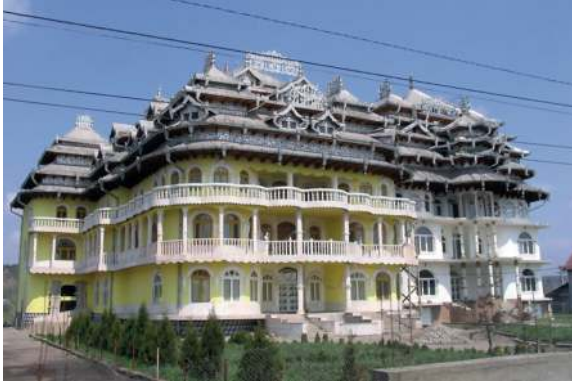
Fig. 5 Conspicuous villa in Turda.