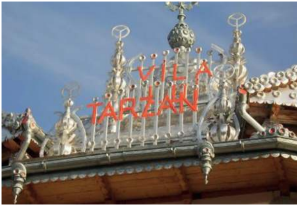
Fig. 6 Presumed status symbols (Mercedes-stars, but upside down) and reference to the owner, named after a well known film figure.

Another way of lavish display, practiced more recently by Rrom , is the building of villas, with expensive and very rich decorations, materials and very spacious (Fig. 5). Often