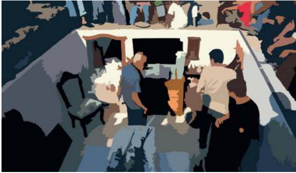
Fig. 8 Furnished burial chamber of a high status Rrom burial.

The comment, by Rrom relatives of the bulibasha Preda of Otaci, on the remark that he was “surprisingly” buried without weapon: “... this tradition is not respected any more ” (emphasis added), 36 could indicate that this was previously practiced. However, details are lacking in this case and there are otherwise no indications or mentions whatsoever of weapons connected to Rrom funerary practices. All these features, while demonstrating the high status of the deceased, do not remain visible but are preserved only in the memory of the participants and onlookers.