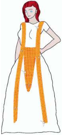
Fig. 3 Bride provided with gold coins on red textile backing at a Rrom wedding in Costești, 2009.