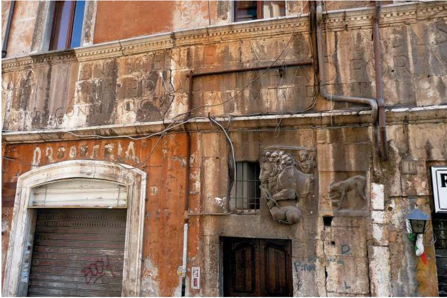
Fig. 1 Spolia in the wall of Lorenzo Manlio's house, with the extensive new inscription above.

togate statue which he entitled VALER PUBL CC (Valerius Publicola, consul more than once), and a fragment of a relief showing the fasces. 18 Santacroce was a prominent civic dignitary at Rome, holding the positions of maestro delle strade in 1449–1450 and conservator in 1466; on a basic level, these images and textual references to Roman magistracy seem to have been designed to convey his authority (in the façade of one of the residences of the della Valle family, great political rivals to the Santacroce, was an ancient relief described as showing ‘a shrouded man holding a book, with two cocks on each side,’ which seems similarly designed to convey power). 19 More specifically, Andrea seems to have decided that Valerius Publicola, one of the four Roman consuls legendarily responsible for overthrowing the monarchy, was an ancestor of the Santacroce family. Like Manlio, therefore, Santacroce identified his family with a known Roman Republican hero.