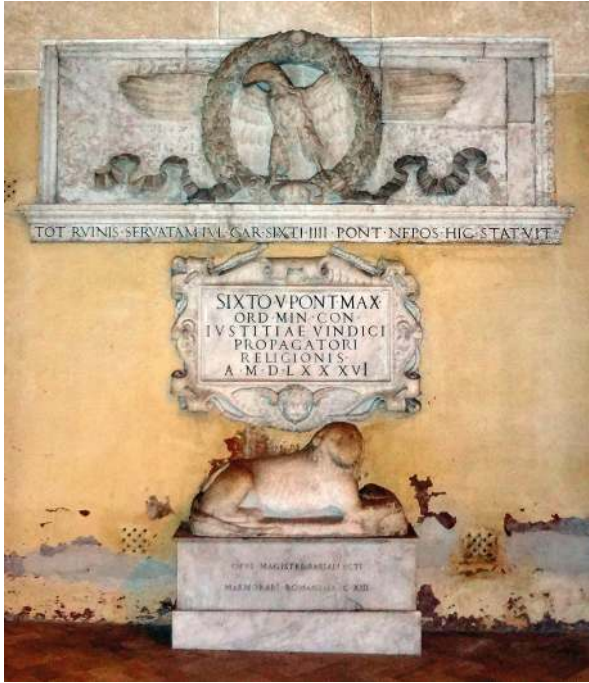
Fig. 2 The porch of Santi Apostoli, Rome.

and there is good reason to believe that the expeditions of Leto and friends to the catacombs were inspired by pious curiosity. 66 Leto's grotto of inscriptions included Christian examples, though there is no reason to believe that they were highlighted in any way. More striking is the collection of a number of Christian inscriptions assembled by the Millini (or Mellini). 67 In 1470 Pietro Millini finished the restoration of the oratory of S. Croce a Monte Mario, and placed various early Christian inscriptions in the pavement outside the church. 68 The oratory was near their suburban villa, where they displayed some classical inscriptions; it seems that during construction, they discovered a pre-Constantinian cemetery, and so removed the inscriptions to redisplay them. They clearly felt that Christian antiquities should be kept distinct from pagan examples. But if we imagine the experience of visitors to the site (the Millini sponsored scholarly symposia), it would have been fairly clear who had collected and displayed both sets of material, and who, therefore, could bask in the prestige that both sets of antiquities brought. Even as pagan and Christian material was kept distinct, therefore, there are