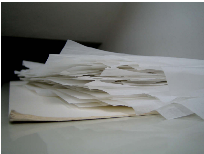
Fig. 2 - Drawings are accumulated in folders inside the drawing file cabinet.

Conservation status is good despite of having storage areas that are necessary to improve and some works should not participate so often in exhibitions.